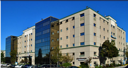
800 West Cummings Park, Suite 1950 1,039 SF