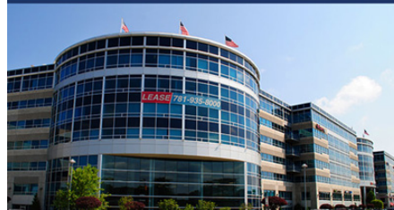
TradeCenter 128, Suite 1930 1,215 SF