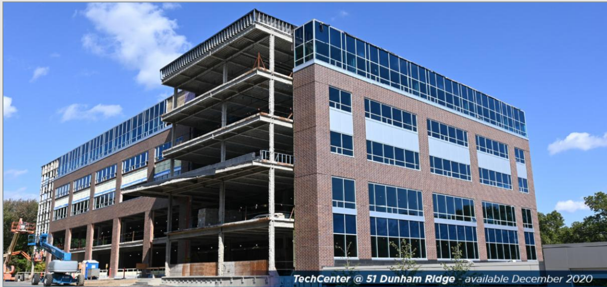
TechCenter @ 51 Dunham Ridge - available December 2020